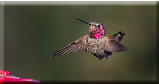
Clockwise from top left: Northern Flicker, Pileated Woodpecker, Red-breasted Nuthatch, male Anna's Hummingbird