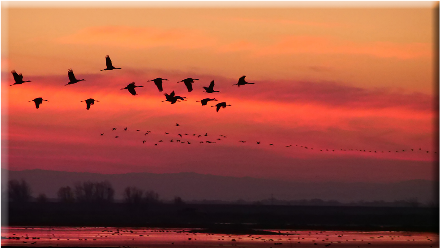
A prior year sunset photo at the refuge

Thursday, October 13 - Merced National Wildlife Refuge