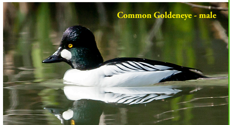
Common Goldeneye - male

Ducks in both groups use their webbed feet to help propel them out of the water but whereas the dabbling ducks feet are situated correctly for a quick take-off so they rise immediately out of the water, the diving ducks need to start moving along in the water before they can get their feet into propulsion mode, and so they have a longer and lower take-off trajectory. As you'll see in a few moments, the Common Merganser is a superb example of that take-off trajectory.