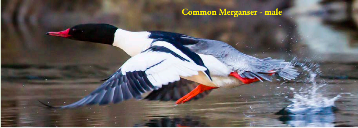
Common Merganser - male

A s this male Common Merganser explodes into the air, you can see that his legs are right at the rear end, and that the take-off trajectory is shallow, telling us that this is a diving duck.