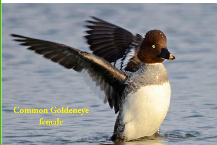
Common Goldeneye female

Barrow's Goldeneye pair, male at left (diving duck). Note the elongated white facial marking.