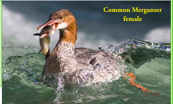
Common Merganser female

T he other merganser, the Hooded Merganser. The male shown here, with that foppish head looks very different from the Common Merganser. Actually, at a distance with only the white head patch visible, it's easy to confuse with the male Bufflehead.