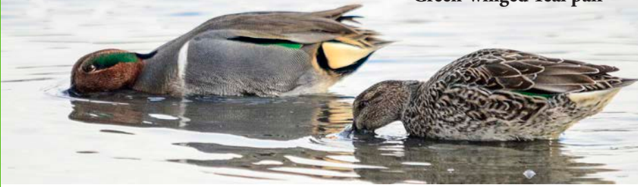
Green-winged Teal pair

G reen-winged Teal pair, male at left. This is a dabbling duck. Note the male's vertical white stripe at the shoulder. The male's green head stripe is similar to that of the American Wigeon, but the Wigeon is rare at higher Sierra elevations.