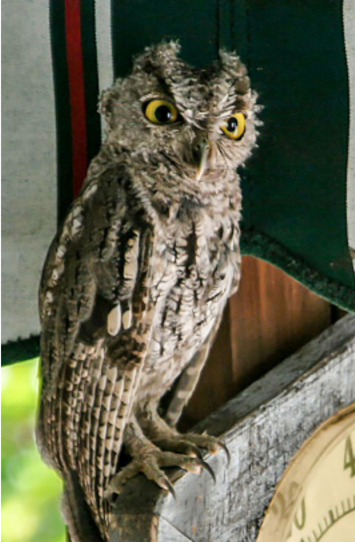
Western Screech Owl - Sue Phalen