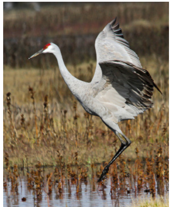
Lesser Sandhill Crane landing - Lucia Gonzalez

J oin us at 7 PM, September 16th in the Tuolumne County Library on Greenley Road in Sonora where I hope to delight you! The public is always welcome at our monthly programs and refreshments are served after the program. Products and publications on a wide range of birding topics are on display and on sale at each meeting.