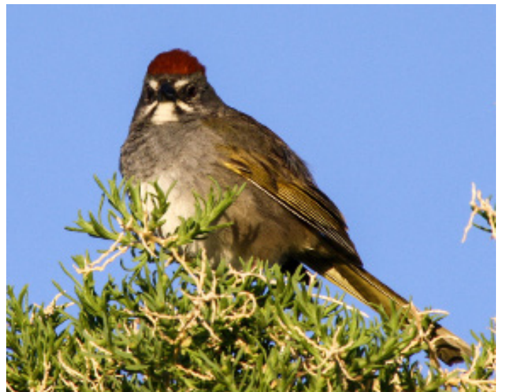
Green-tailed Towhee